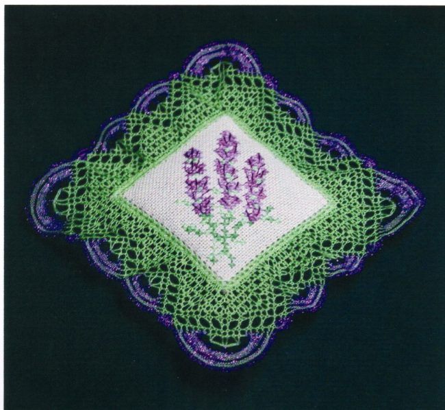
Working diagram © Eve Morton 2009