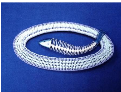
4 Fishy on the Cat's Dishy Cloth stitch, Fishbone, Ribbon (var)