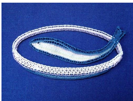
1. Fishy on a Dishy Basic Cloth stitch, Half stitch and Ten stick