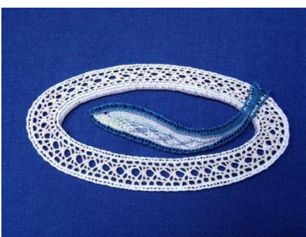
2. Fishy on a Posh Dishy Cloth stitch, Basket weave, Orchid 3