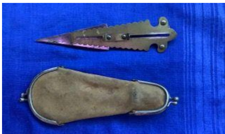
September's Mystery Object (Top) and November's Mystery Object (Bottom)

The brass object (top) is a buttonhole cutter. The sharp steel blade could be pushed out to the desired width, using the numbers along the central slot as a guide to size.