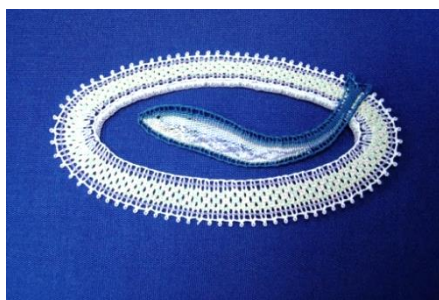
3. Fishy on an even Posher Dishy Cloth stitch, Lattice 3 (var)