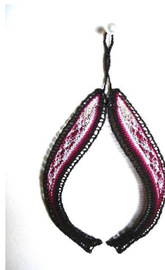
5. Red Herrings Double end start, Cloth stitch, Basket weave, Half stitch plaits

Lacemakers may choose whichever pattern suits their whim and experience.