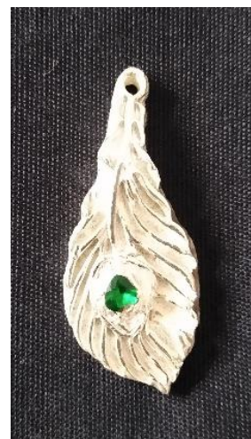
Silver Clay Feather